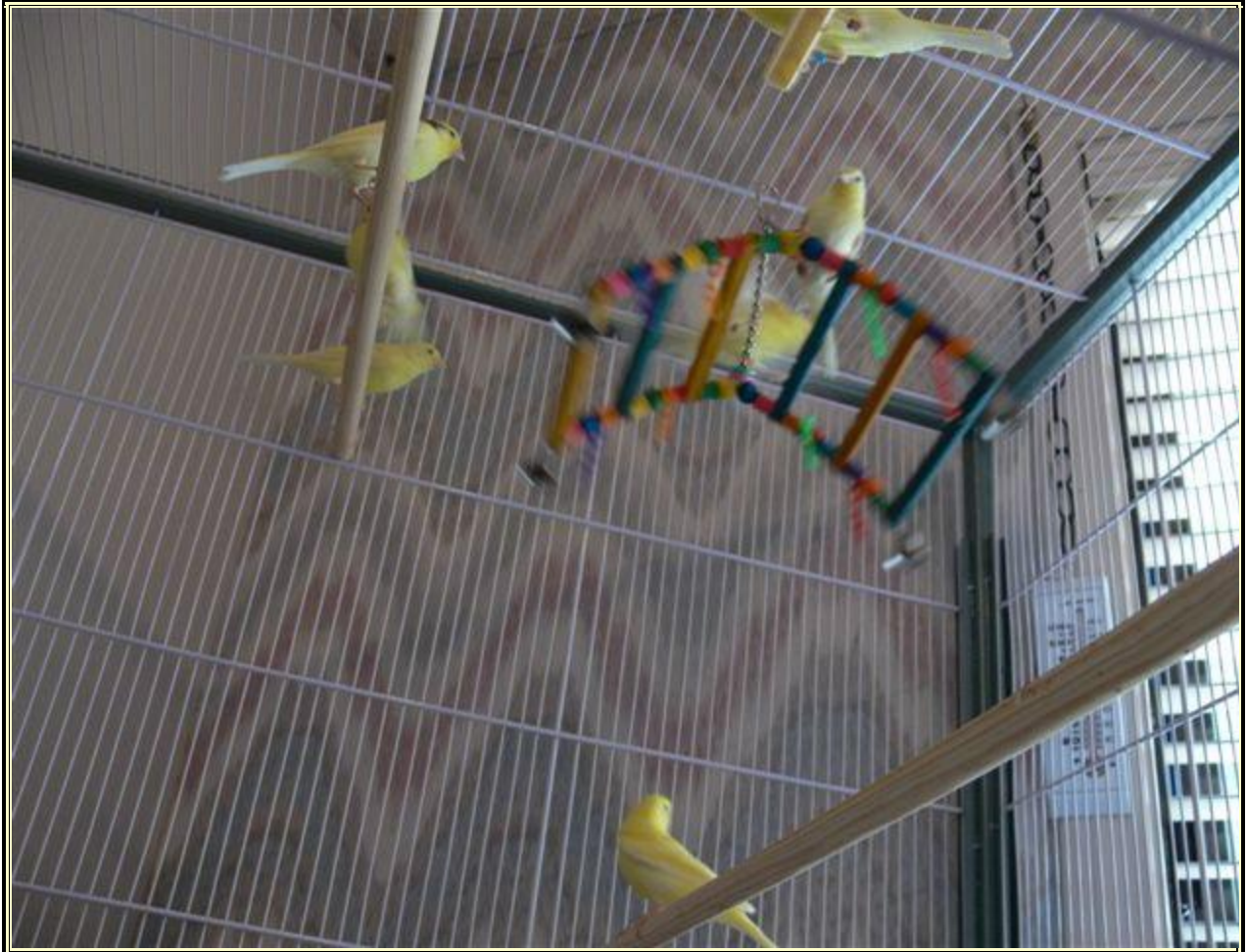
Sally took a picture of the ladder swing her birds really enjoy.